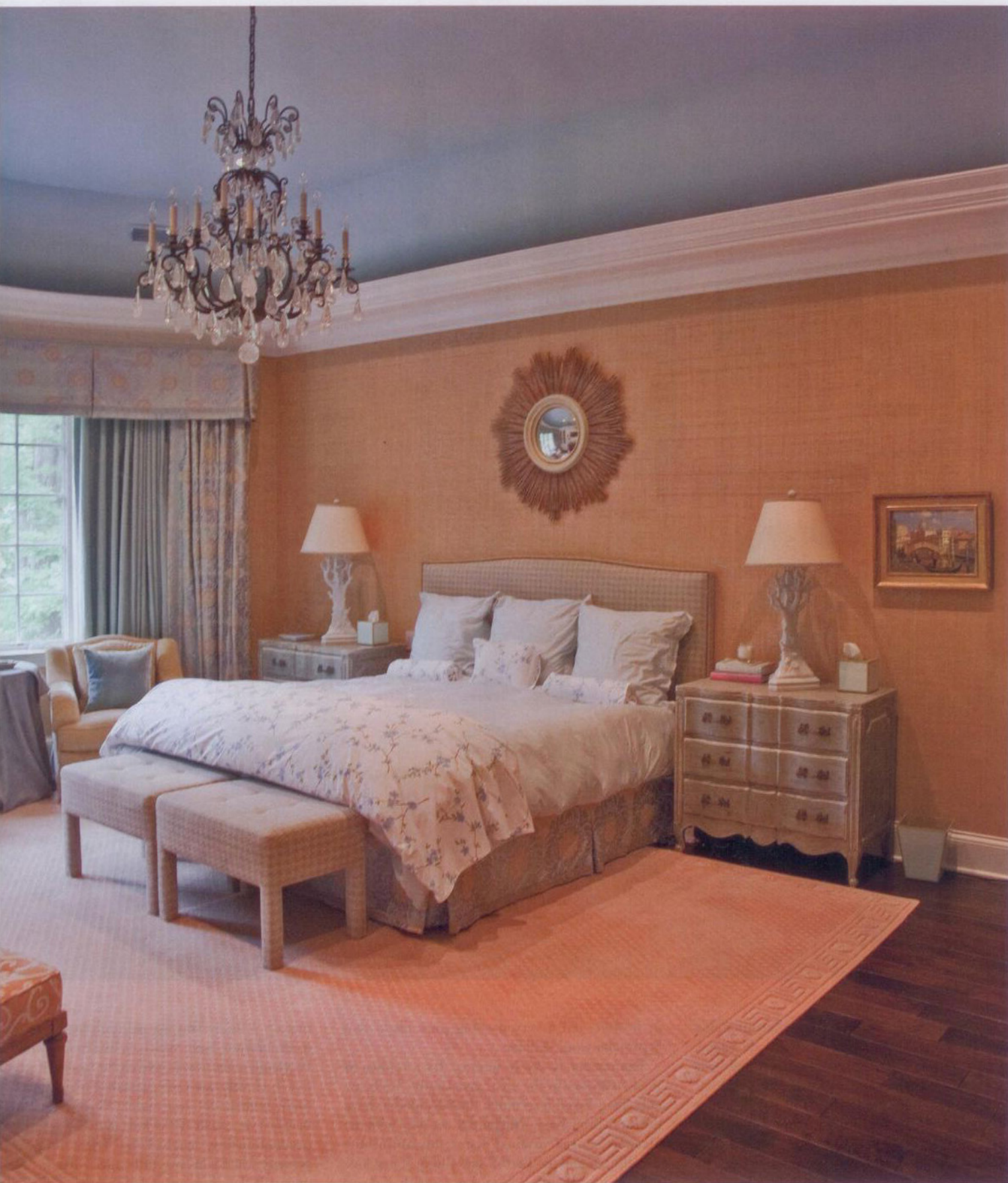
THE MASTER BEDROOM—A SOOTHING OASIS FOR THE BUSY COUPLE—IS “HEAVENLY...IT’S THE ONLY ‘TRANSPLANT’ ROOM FROM THE FAMILY’S FORMER APARTMENT ON OAK STREET IN CHICAGO,” SAYS CINDY.